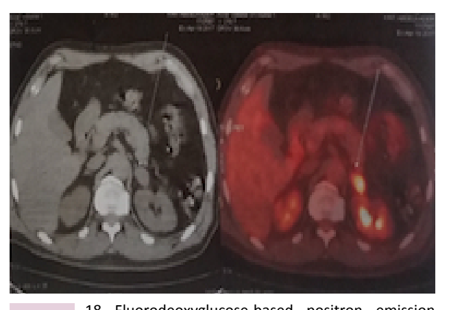
Figure 3 18 Fluorodeoxyglucose-based positron emission tomography scan with hypermetabolic lesion in the left adrenal gland.