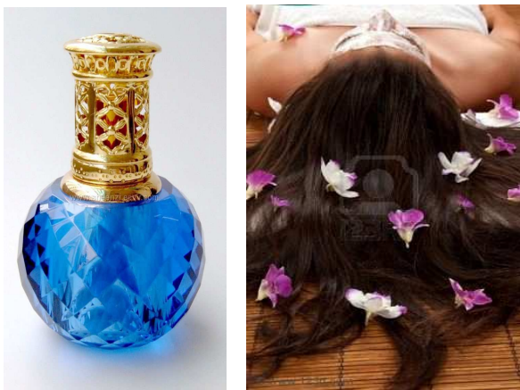
Figure-4: Essential oils in aromatherapy

because they are worried that others may copy their creation. By asking the seller more about the blend, and listening to how they respond, you should have a better idea about the quality of the blend being sold. Good suppliers should be happy to provide you with a list of the ingredients. They understand that some individuals must avoid particular oils due to health problems.