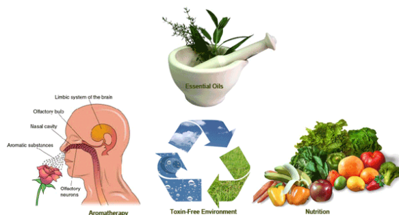
Figure-2: Aroma from essential oils