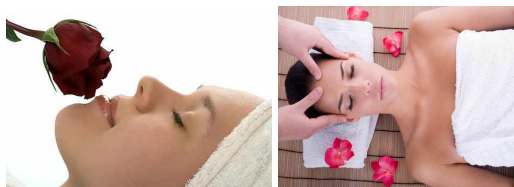
Figure-5: Aromatherapy for altering a person's mind, mood, cognitive function or health