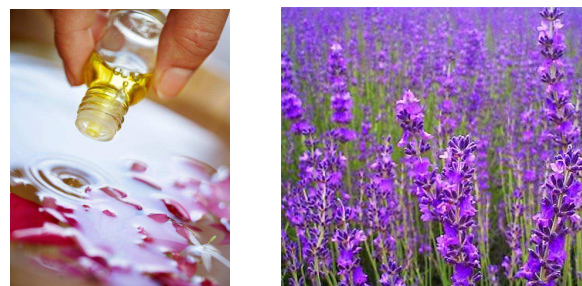
Figure-3: Essence of essential oil from nature

Essential Oil Blends: Essential oils can be blended together to create appealing and complex aromas. Essential oils can also be blended for a specific therapeutic application. Essential oils that are carefully blended with a specific therapeutic purpose in mind may be referred to as an essential oil synergy . A synergistic essential oil blend is considered to be greater in total action than each oil working independently. AromaWeb's Recipes area offers a variety of recipes and synergies.