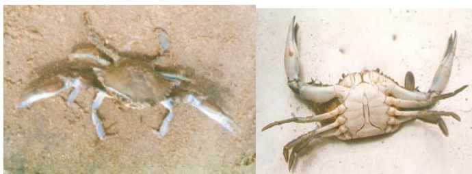
Plate 3: The dorsal and ventral view of Male Callinectes amnicola .