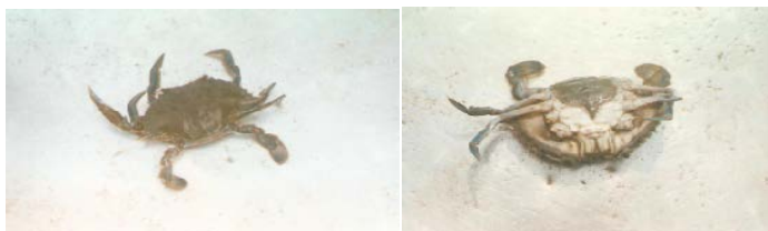
Plate 4: The dorsal and ventral view of female Callinectes amnicola .