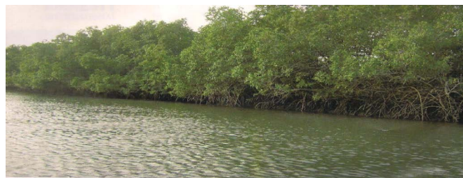
Plate 1: Bodo Creek before the Oil Spill (2008).

Bodo creek is situated at Latitude 04^{\circ}36' \text{ N} East and Longitude 7^{\circ}15' \text{ E} in Gokana Local Government Area of Rivers State, Nigeria. Bodo Creek is a network of creeks and creek-lets on the upper reaches of the Andoni-Bonny river system (Plate 1). The creek adjoins Bodo community, administratively located in the Gokana local government area of Rivers State, Nigeria (Figure 1). The creek structure and pattern of hydrology have been described by Zabbey (2012). Traditionally, Bodo Creek is a strong livelihood support base for the people of the Bodo community and their neighbours. The creek provides readily incentives for fishing, transportation, cassava fermentation, fuel wood