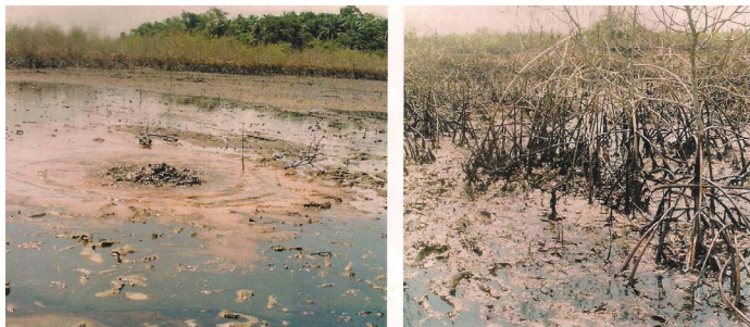
Plate 2: Bodo Creek after the Spill.

The result of the variations in the concentration of heavy metals in the sediment from Bodo Creek obtained from the three Stations is presented in Table 1. These heavy metals were present in the sediment at varying concentrations. The order of abundance of these metals in the sediments of the Three stations were Fe>Cd>Pb (Table 1). Fe attained its highest value at station 3 followed by station 2 while its lowest was observed at station 1. The highest for Cd and Pb were recorded at station 1 and station 3 respectively, while their lowest was recorded at station 2. However Fe and Cd was significantly different across the three stations while Pb has no significant different across the three stations. Comparing the present results with the WHO standards, it is obvious that the concentration of the metals (Fe, Pb, and Cd) in the sediments is hazardous to health as it exceeds permissible limits.