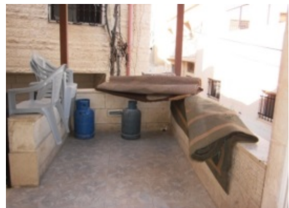
Figure 3: The balcony in the urban setting, representing a potential risk of fall.

Comparing the three settings: The observations of the homes indicated a similar high number of hazards among all settings, as presented in Table 2. The hazards that appeared for most of the families in the three settings were under the following categories: heating (N:12), electrical socket (N:11), sharp object (N:11), hob (N:10), and flooring (N:10). No water storage hazards were observed in any of the settings. Baby walker hazards also were not observed at the time of the study, although some of the families reported having them in the past (Table 2).