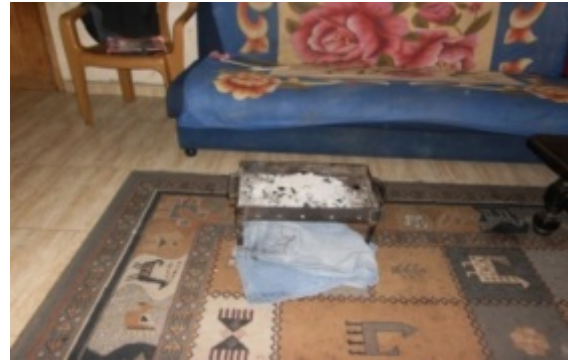
Figure 2 The heating devices in the rural setting, representing a potential risk of burns.

Other hazards could be linked with the home structure and the family financial status, similar to the camp and urban setting, such as having a low height balcony without any protective bars (Figure 3).