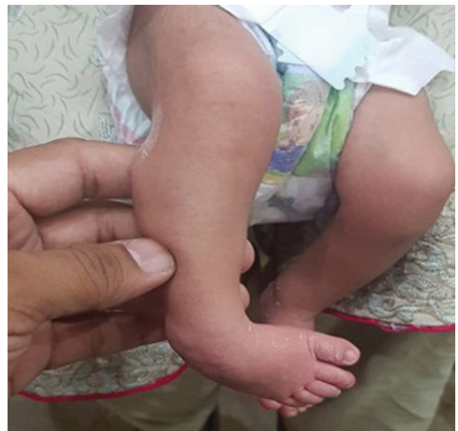
Figure 3 Infant with unilateral clubfoot.