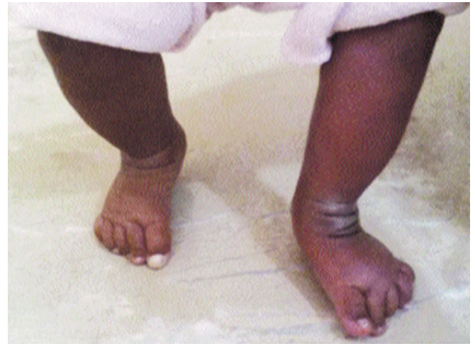
Figure 7 After completion of treatment with full correction of deformity.