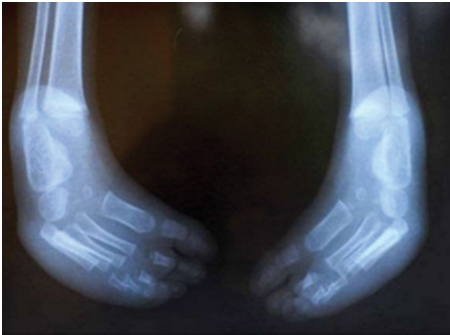
Figure 4 X-ray of infant with bilateral TEV.