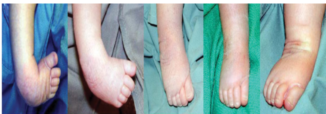
Figure 5 Ponseti method involves manipulation of foot from being adducted, inverted and flexed to being abducted and extended.