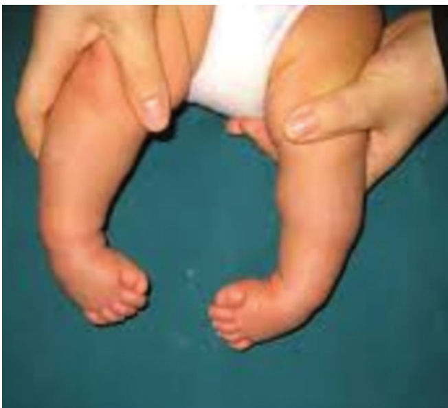
Figure 6 Bilateral clubfeet.

without surgery with the help of dedicated surgeons and parents [23]. But it is difficult for the parents to get treatment at their