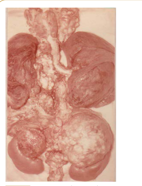
Figure 3 Mono-block formalin-fixed specimen showing the lungs; the primary right tumor is next to the coalesced mediastinal lymph node deposits. The selective association is apparent from the cross over not only to the left neck nodes but also to the left adrenal gland.