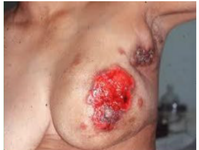
Figure 3 Damage the whole breast spread to other body parts Sever pain and finally death will happened.

classify it as benign or malignant based on the features extracted from the thermal pattern of the image. The system allow physician to store their patient's history on database server, to search, to update and/or delete the history of the patient. We face different challenges while developing this device. For instance financial problem to purchase the material needed, getting patients while we investigate the problem, shortage of