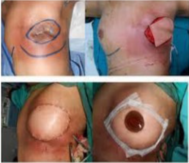
Figure 2 If cancer cells are not detected at an early stage the following will be happened.