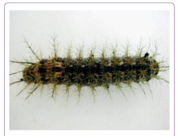
Figure 1 Image of a specimen of Lonomia obliqua , demonstrating the numerous distinct bristles that are usually the first parts of the caterpillar to come in contact with the patient and from which the toxin is liberated.

Accidents with bristles of Lonomia (or commonly known as the Taturana) are often associated with a coagulation disorder and a hemorrhagic syndrome [1]. It was first described by Arocha – Pinango in Venezuela in 1967 [2]. After 24 hours, a severe bleeding disorder ensues, leading to ecchymoses, pulmonary and intracranial hemorrhages [3,4] was well as acute renal failure [2,5]. Since 1989 accidents by Lonomia have been reported in the southern region of Brazil [6], with an incidence of 1.1 to 24.6 cases for one hundred thousand inhabitants [7]. Envenoming Lonomia has a reported fatality rate of approximately 1.7% [8] to 2.5% [7]. In the present report, we describe a rare case of severe coagulation disorder in a 2.5 year old female child who came in contact with bristles of the caterpillar Lonomia obliqua, (Figure 1) having received specific anti-lonomic antidote serum and neurosurgical evacuation of a massive epidural hematoma, as well as performed a systematic literature review.