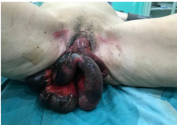
Figure 2: Edematous loops of small bowel hanging outside the vagina with dusky appearing mesentery.