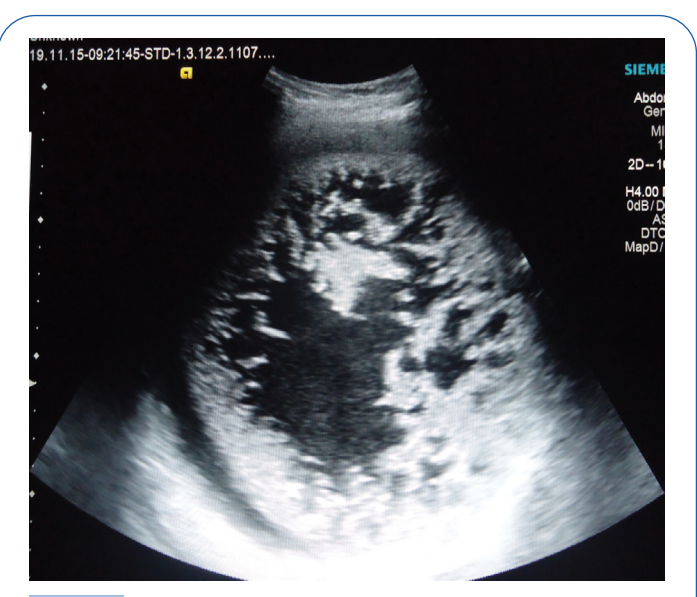
Figure 1 Trans-abdominal ultrasonography demonstrating the uterine mass in part with mixed echogenic appearance; fatty components are seen as echogenic areas with central cystic hypoechoic degenerative change containing internal echoes. 'Finger like' inner marginal irregularity of central degenerative area noted.

Giant uterine myomas are rare benign smooth muscle neoplasms with less than 100 cases documented worldwide. Although the exact etiology is still unknown, genetic predisposition and hormonal influence (Estradiol and progesterone) have been implicated [4]. Fatty metamorphogenesis of the smooth muscle cells are the most likely cause for the development of