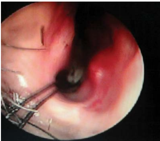
Figure 1 Endoscopic view of the angiofibroma