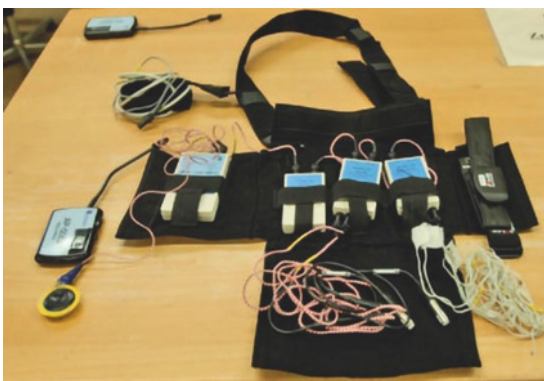
Figure 1 A fieldable mobile physiological laboratory (mobPhysioLab®) was used in the abovementioned studies.

The described modularity and the versatile applicability regarding adaptation options and the system's mobility have yet to be commercially available in this form. The freely programmable software applications give users various modification options depending on the special applications and requirements. Thus, only the individual wearer's appropriate parameters are recorded, making the system extremely flexible and lighter (Figures 1-4).