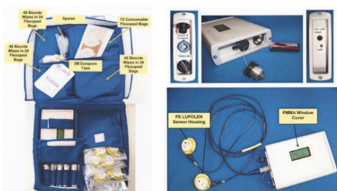
Figure 2 Space suitable mobPhysioLab® is currently used at the International Space Station (ThermoLab).