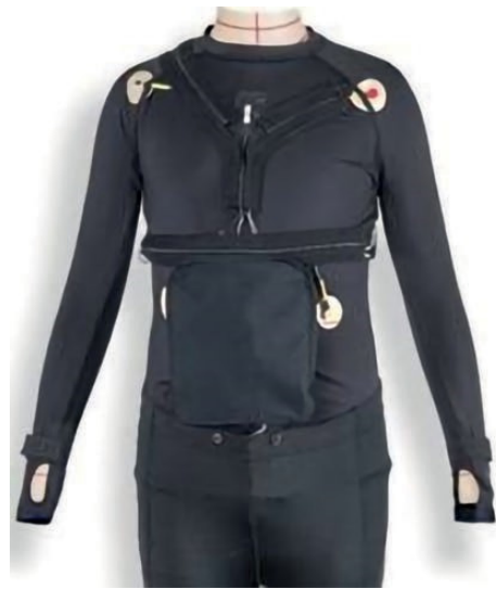
Figure 3 Prototype of a sensor suite (smart textile) used for recording skin temperature at the extremities, skin moisture, respiration rate, and heart rate.