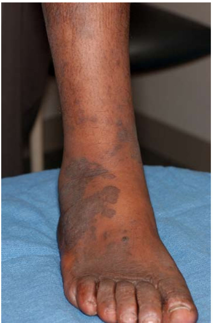
Figure 1. KS plaques of the lower extremity

cell receives several copies of the viral genome at cell division. Most cells in both KS lesions and KSHV-infected cultures are latently infected, with lytic replication occurring in only a subset of infected cells. However, as discussed elsewhere and summarized in Table 2, it appears that both phases of the virus life cycle play significant roles in the pathogenesis of KS.