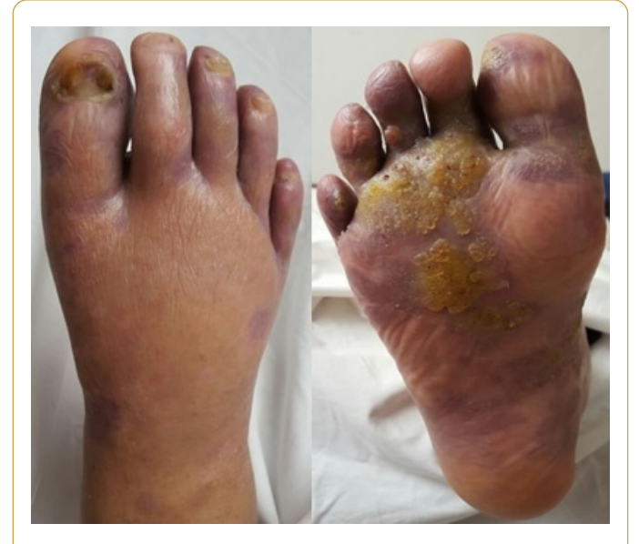
Figure 5 Dorsal view (A) and plantar view (B) of the right foot 6 month after treatment showing a good response to radiotherapy.