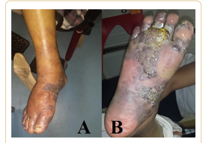
Figure 1 Dorsal view (A) and plantar view (B) of the right foot before radiotherapy showing violaceous patches, plaques and nodules with different sizes.

photons with water bolus at a radiation dose of 8 Grays in one fraction was given. After one and six months of treatment, the clinical revaluation showed a good response ( Figures 4 and 5 ).