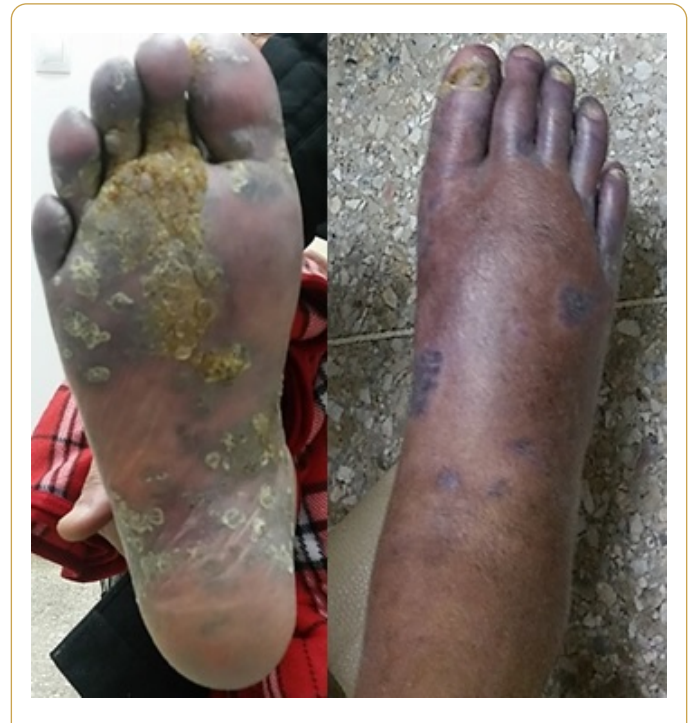
Figure 4 Plantar view (A) and dorsal view (B) of the right foot 1 month after radiotherapy showing clinical improvement of lesions.