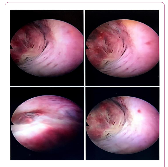
Figure 3: Hysteroscopic image showing cervical ectopic pregnancy embedded on the left lateral wall of the cervical canal.

with 10 mls of fluid and vaginal balloon with 40 mls fluid. Estimated blood loss was 80 mls with saline fluid deficit of 400 mls.