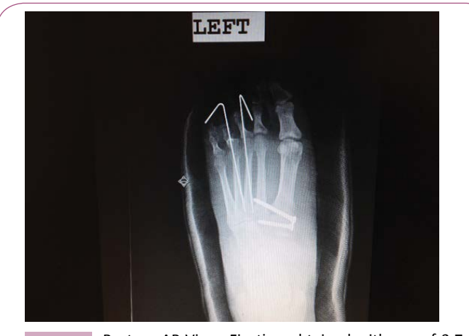
Figure 3Post-op AP View: Fixation obtained with use of 3.7<br/>mm x 30 mm and 3.7 mm x 40 mm screws, and two<br/>K-wires along the second and third joint.

Open reduction using parallel incisions in the dorsum of the foot and small fragment screws was the preferred method of choice for first and second metatarsal joint injury [5]. K-wires were used to stabilize the lateral column [14].