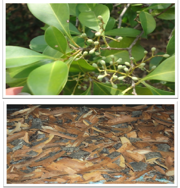
FIG 1: Chionanthus zeylanica Linn., FRIUTING AND STEM BARK

Chionanthus zeylanica L., (FIG 1) belongs to the family Oleaceace Sp. Pl. 1753; Bhargavan in Fl. Tamil Nadu 2:70. 1987. Linociera zeylanica (L.) Gamble in Fl. Pres. Madras 2:558. 1957 (repr. ed.); FTC 3:890. L. Purpurea Vahl, Enum. Pl. 1:47. 1804; FBI 3:608. Evergreen shrubs or small trees, 2-5 m tall. Leaves 3-7 x 2-4 cm, ovate-obovate, obtusely acute or emrginate, base cuneate, thick coriaceous, glaucous green. Flowers 4-5 mm across, white mildly fragrant in 3-5 cm long; axillary panicles. Drupes 4-6 x 2-3 mm, ovoid-oblong, apex mucronte, purplish-brown. Common in dense scrubs from coast to foot of hills. Fl & Fr: January-May. Ln: Punagani, Punisi. Lu: Bark used to control white discharge in ladies. Ld: Penchalakona: ASR 8611: Sriharikota : ASR 417: Venkatagiri: ASR 2607. World: Sri Lanka, Peninsular India.<sup>19-20</sup> Commonly grow in dry deciduous forests. Papanasanam, Akkagaralagudi, Microwave station and Srivariparvetimandapam area in Tirumala, Chelluru reserve forest, Mamandur, Talakona. Kilasakona.<sup>21</sup> The present paper deals with the phytochemical screening and antioxidant activity for all crude extracts of the plant material.