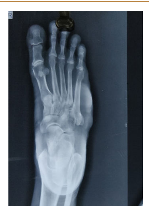
Figure 1: Showing soft tissue swelling shadow over dorsolateral aspect of right foot with no bony pathology.

circumscribed tumor composed of proliferating mature adipocytes. The classical morphology of a pleomorphic lipoma was seen consisting of adipocytic cells admixed haphazardly with dispersed spindle cells and scattered pleomorphic cells (Figure 3).