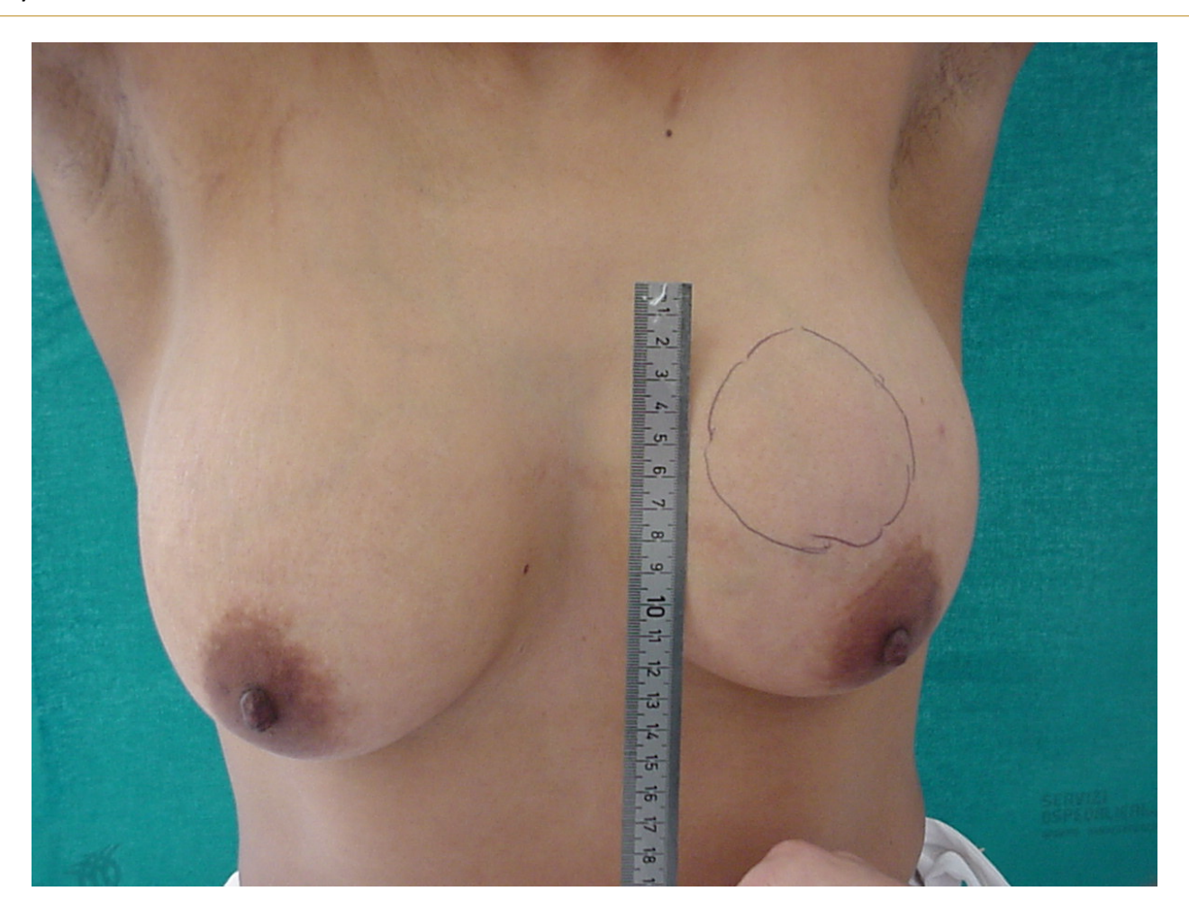
Figure 1 Patient before chemotherapy.

37 years old pre-menopausal patient with a large (7 cm) breast cancer (fnab: ER-, PGR-, KI 67, 70%, Cerb-2) (Figures 1 and 2).