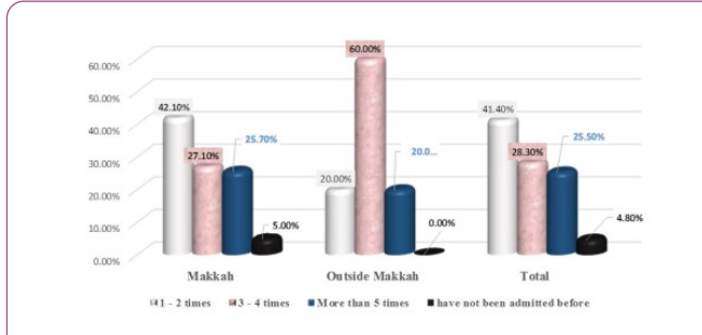
Figure 3 Distribution of sickle cell anemia pediatric cases regarding to the frequency of complications-induced admissions.

Acute chest syndrome is not uncommon cause of hospital admission among our set of pediatric patients. It is the most common cause of morbidity and mortality in children and adult with SCD [23]. Quite often, patients required ICU care with ventilation and/or exchange blood transfusion [24]. In our patients, acute chest syndrome tends to be relatively mild; none of them required ICU care or exchange blood transfusion. Acute chest syndrome was probably triggered by chest infection, especially since many were preceded by cough and coryzal symptoms [25].