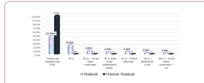
Figure 1 Diagnosis of pediatric cases with sickle cell anemia at admission.