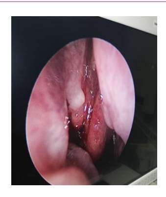
Figure 2 Endoscopic image showing mass at left nasal cavity extending posteriorly to the nasopharynx.

chemotherapy with R-CHOP (Rituximab, Cyclophosphamide, Doxorubicin, Vincristine, Prednisone). He is still undergoing chemotherapy, but his tumour has shrunken in size with resolution of the pleural effusion ( Figures 1-3 ).