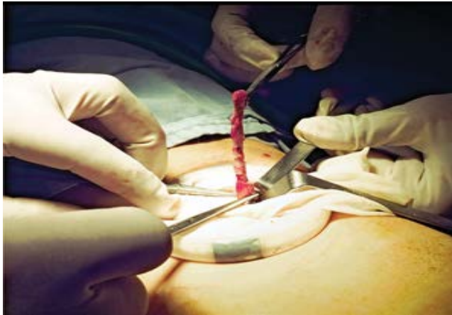
Figure 1b Peroperative photography showing a not inflamed appendix.

was discharged home on the 11 th post-operative day, and is now at 2 years of follow-up.