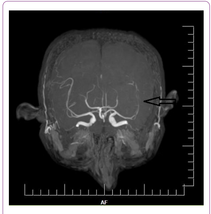
Figure 3 Cranial MR angiography: Decreased calibration in the post-bifurcation segments of left middle cerebral artery.

Since the patient was seizure-free with, LM and lacosamide, and his muscle strength showed a mild-to moderate recovery, the patient was discharged with his AED regimen, and 3/5 muscle strength in his left upper limb and 4/5 muscle strength in his left lower limb after 2 weeks. He was able to walk with support and a physical therapy program was planned for the patient. In his 1st month follow-up visit, he was still seizurefree and he was able to walk without any support.