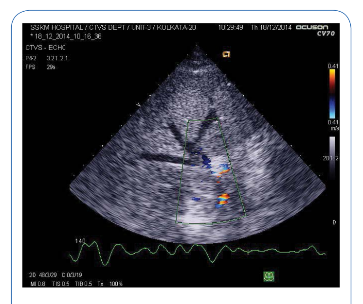
Figure 2. Transthoracic echocardiography image showing dilated hepatic veins and tumour completely obstructing junction of IVC and right atrium.

factors such as local infiltration of perinephric tissue, lymph node involvement, distant metastases, the pathological stage of the renal cell carcinoma and the presence of vena cava side wall invasion [1]. For tumours extending into intra-cardiac structures, a holistic approach is required involving radiologist, anaesthesiologist, urologist and cardiothoracic surgeon. The use of cardiopulmonary bypass is required for safe and complete excision of renal cell carcinoma extending to the intracardiac structures [2]. Some authors have demonstrated lesser intraoperative complication rates when cardiopulmonary bypass was used for level III (retrohepatic intracaval) tumour excision [3].