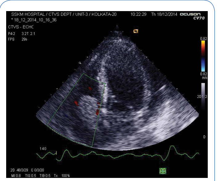
Figure 1. Transthoracic echocardiography showing tumour thrombus protruding from right atrium into right ventricle through tricuspid valve on apical four chamber view.