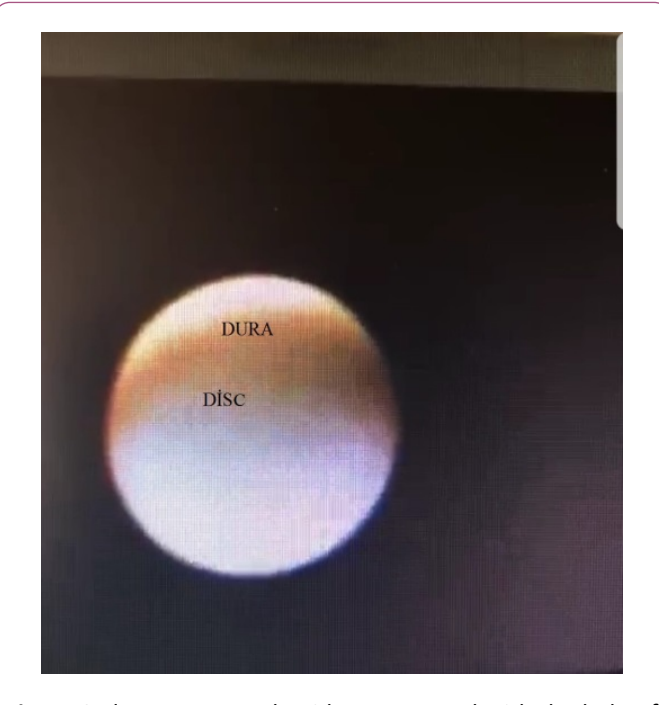
Figure 2 Fluoroscopy and epiduroscopy and with the help of a video image.

disc was later decompressed by epiduroscopic confirmation. The operation notes revealed that when the procedure was completed, the video was removed and the incision in the sacral hiatus was sutured.