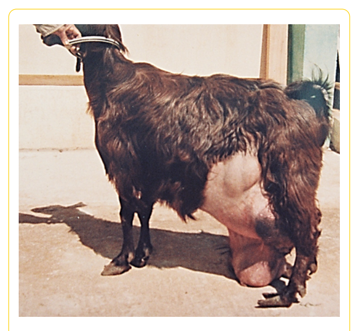
Figure 2 Adult pregnant Shami breed doe with rupture of the prepubic tendon. Notice the mammary glands were dropped on the ground which exposes the animal to injury and possible infection.

Caesarean sections revealed the presence of three fetuses in one doe and two fetuses in each of the other two does within apparently normal uteri. The abdominal floor was normal and no hernia was detected. The three does survived the surgeries and recovered from anesthesia uneventfully.