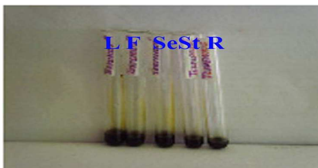
Figure 3. The formation of redish brown colour in the plant extracts of Terminalia chebula when treated with chloroform containing concentrated Sulphuric acid solution thus indicated the presence of Terpenoids. Note where L--Leaf, F--Fruit, Se--Seed, St--Stem, R--Root.