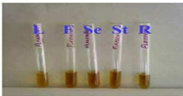
Figure 2. The formation of yellow colour in the plant extracts of Terminalia chebula when treated with 5% Sodium Hydroxide solution containing diluted Hydrochloride solution thus indicated the presence of Flavonoids. Note where L--Leaf, F--Fruit, Se--Seed, St--Seed, R--Root.