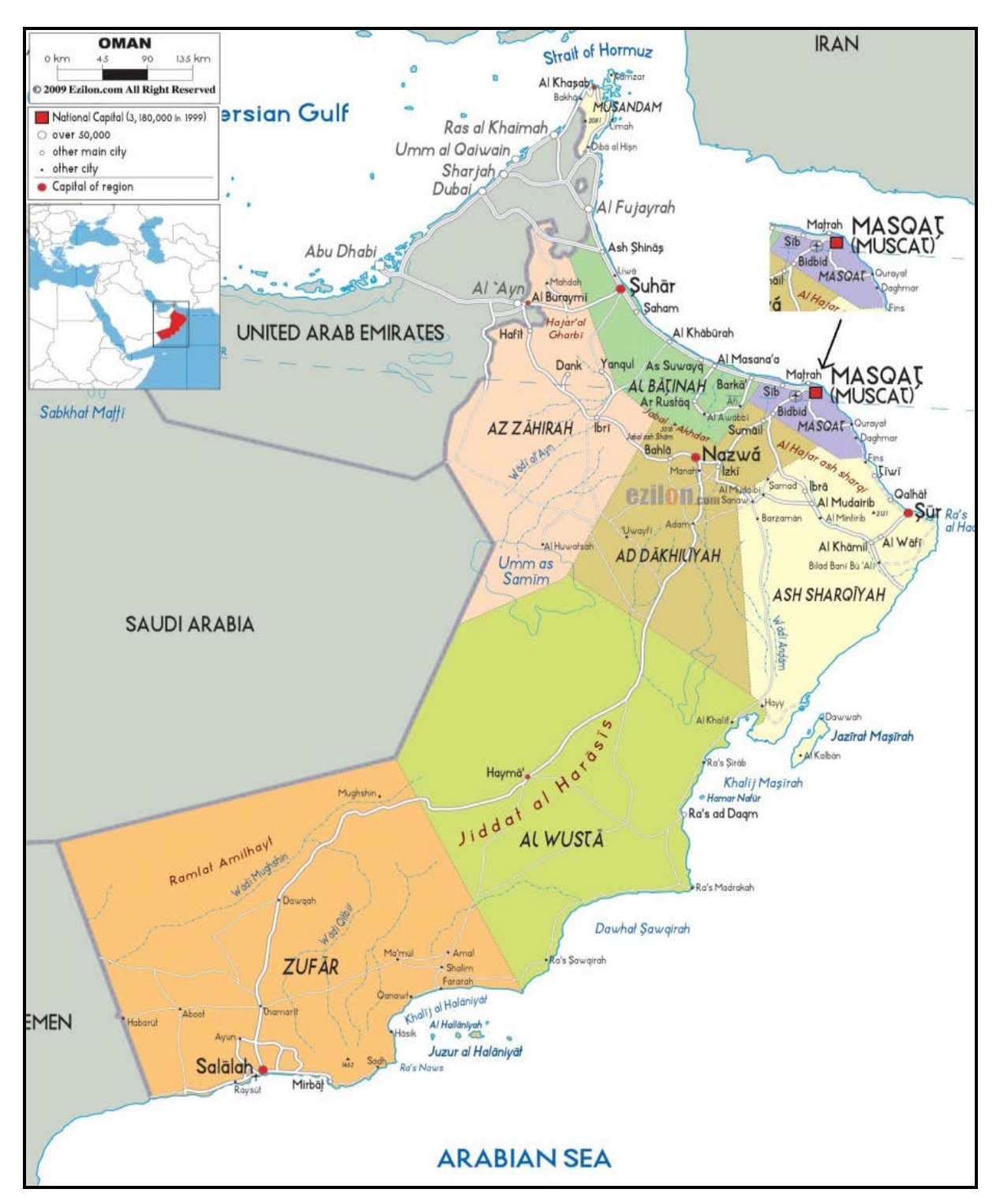
Figure 1. The Study area of Sardinella longiceps in Muscat.