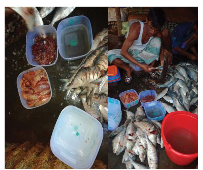
Figure 2: Pictorial view of Hilsa egg collection from Hilsa fish at Fish Landing Center of Chandpur, Bangladesh.