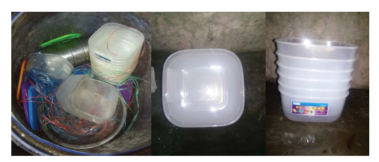
Figure 3: Pictorial view of Hilsa egg packaging materials (plastic boxes).