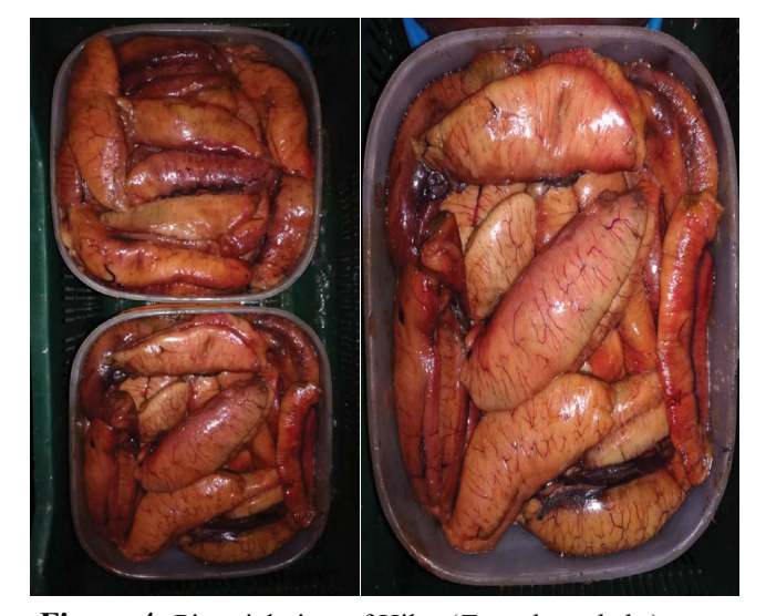
Figure 4: Pictorial view of Hilsa (Tenualosa ilisha) eggs.

fishes are stored in the ice/freezing boxes. Among them, some Hilsa fishes are found to be lower grade in terms of quality due to improper handling. That means these Hilsa fishes can't be sold at better prices. Hilsa eggs are separated from the inside of these lower grades Hilsa during the salting process (locally called as