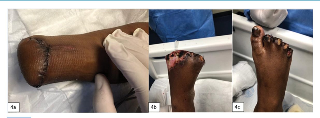
Figure 4 (a) Left hand at the level of the distal third of the diaphysis. (b and c) feet at the forefoot level.

complications. A rise of the D-dimer and procoagulant levels are seen, which are associated to a higher mortality [11,12].