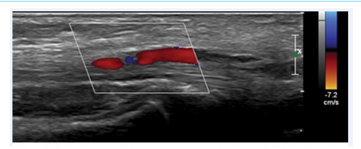
Figure 3 Echo-Doppler of the left upper extremity where diminished blood flow can be seen at the forearm level.