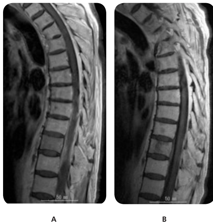
Fig. 2. Vertebral MRI pre- and post-radiation: A, lesion in thoracic level Th9 to Th11 extending to intraspinal canal before radiation and B, after radiation (sagittal and transverse).

After the surgery the patient was treated with temozolamide (TMZ) and radiotherapy by local irradiation of 60 Grays (Gy) in 30 fractions. He then received TMZ once a week as an out-patient. 6 months after the surgery he presented lumbago. From next day he showed weakness of bilateral lower extremities, therefore, he admitted our referred hospital again. However he became paraplegic within a day. A MRI on admission showed a diffuse lesion at the thoracic levels from Th9 to Th11 and compression of the spinal cord ( Fig. 2, A ). Because of the compression of the spinal cord, the clinical findings and the age of the patient we administrated in emergency a local radiation of 25 Gy in 5 fractions. A post-radiation vertebral MRI demonstrated a decreased in size of the lesion ( Fig. 2, B ).