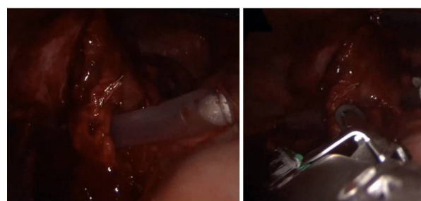
Figure 2: Fig 2. Conventional Foley cathater passing for staple