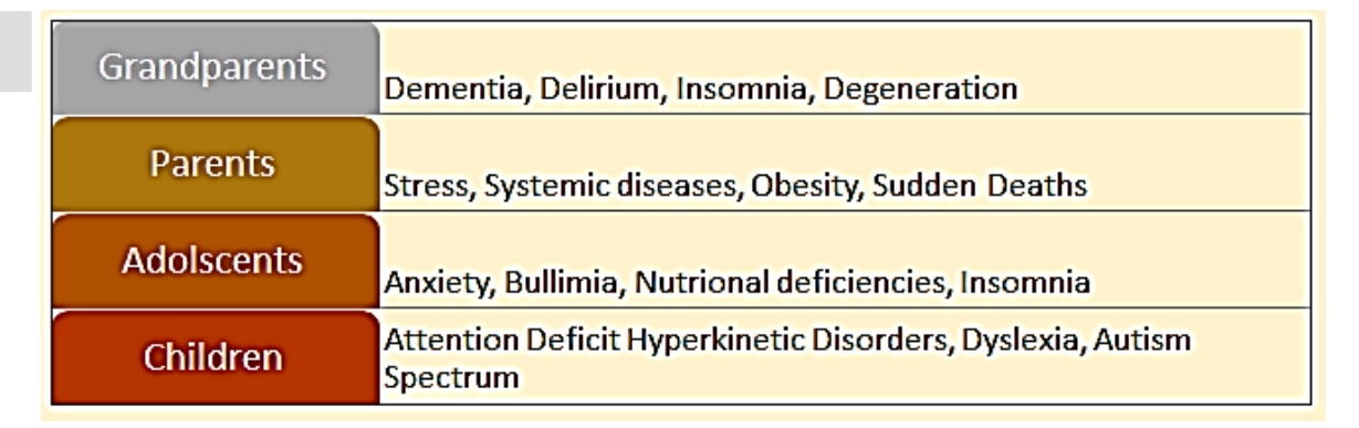
Fig. 2. The causal relation.