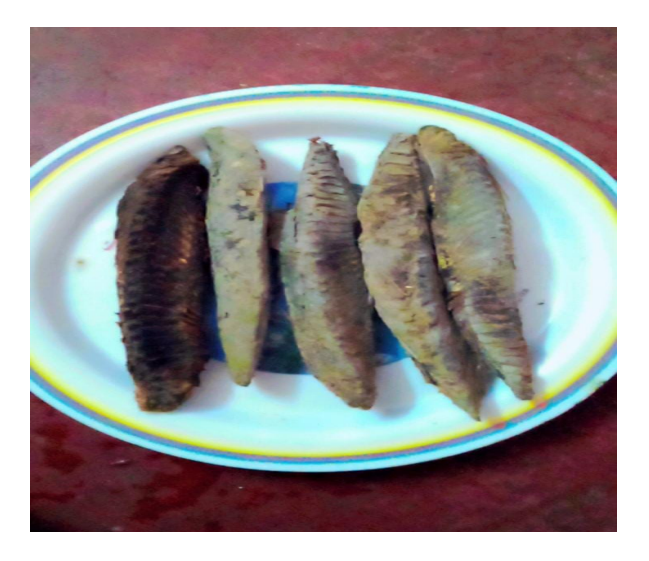
Fig. 3. Mass meen.

into pieces, washed and cooked in brine for 2 hours. Smoking is performed over the brined tuna for 2 to 3 hours using smoke from burning coconut husks (Thondu). This is an important process to help preserve the fish as the smoke delivers an acidic coating onto its skin surface. This coating prevents oxidation and slows the growth of bacteria, which in turn slows the decomposition of fish. The smoked fish is sun dried and stored in containers as mass meen (Fig. 3.).