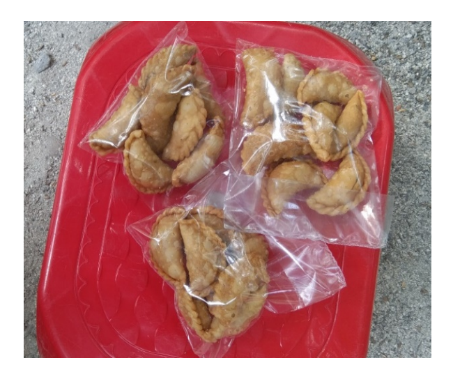
Fig. 5. Mass appam

mass appam, mass and coconut gratings are mixed and are covered with flour spread, then and cooked in oil (Fig. 5.).