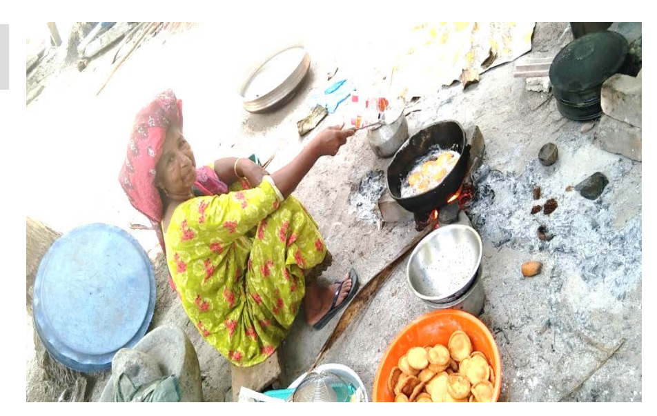
Fig. 4. Open kitchen space for preparing traditional Tuna food items.

"Mass podichath" is made by cutting dried Tuna into small pieces and mixed with coconut, turmeric powder, onions and garlic, grinded into a powder form. This is consumed along with rice. For