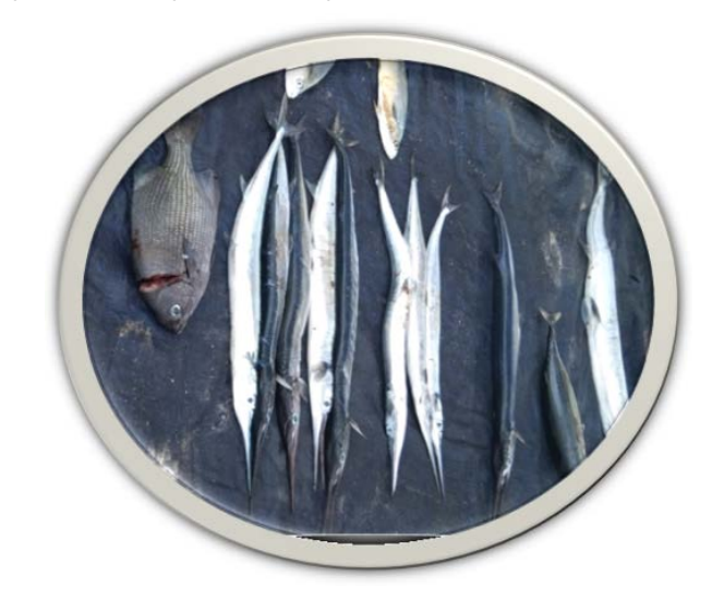
Fig. 1. A glimpse of landings at Androth fish market.

Tuna fishes (Yellowfin and Bluefin tunas) and small Tuna fishes (Skipjack), Lagoon fishes (reef fish, rainbow runner, seer fish, and sail fish) and octopus. Skipjack is the most occurring among the Tuna species caught. Normally target landings are achieved during the monsoon when the fish numbers are increased due to a favorable productive time.