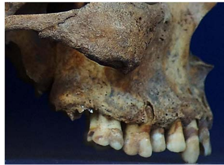
Figure 3 Calculus on the buccal surface of premolars and molars, on the right side of the alveolar arch, and atrophic bone changes in the alveolar arch of the skull from grave no. 942 (Czysty Square in Wrocław).

Analysis of a digital image acquired using spiral computed tomography of higher voltage and longer exposure time (85 kV/ 21 mAs, 20 s) revealed the area of proliferated neoplastic tissue and changes in the structure of the compact substance of the bone and midline of the mandibular corpus. The recorded image shows an irregular hyperplasia of bone lamellae, formed on the inner side of the mandibular corpus, causing secondary