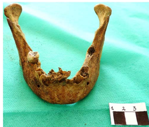
Figure 2 Hyperplasia in the mandibular corpus located on the line of alveolar arches between incisors.

based on the skeletal and dental morphological features during macroscopic analysis. We analysed the expression of features in the supraorbital area, and the shape of the orbital openings, glabella and temporal, zygomatic and mastoid areas on both sides. We assessed the squama of the occipital bone for the presence of an external protuberance. In the mandible, we assessed the expression of the mental protuberance, the size of the gonial angle, and the course of the posterior margin of the mandibular ramus. In addition, we analysed the size of muscle insertions within the stomatognathic system [13-15].