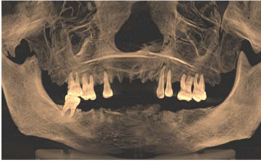
Figure 5 panoramic radiographs of the alveolar arches in the skull from grave number 942 (Czysty Square in Wrocław) Spongy bone hyperplasia within the mandibular corpus and alveolar arch (marked area).