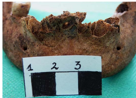
Figure 4 Tumour-like hyperplasia in the alveolar process and mandibular corpus in the skull from grave number 942 (Czysty Square in Wrocław).

changes in the normal structure of the compacted bone and partly in spongy bone. We concluded that this condition is most characteristic of a neoplastic lesion, defined as osteoma spongiosum and different from other types of osteoma, e.g. osteoma durum, formed almost entirely from compact bone, or from neoplasm-like developmental changes or chronic reactions suggesting periostitis [49,52] ( Figure 6 ). In addition, the image of hyperplastic bone tissue resembling the substance of spongy bone, with a delicate sclerotic capsule and no clear foci of osteolytic lesions, rules out malignant tumours such as osteosarcoma, osteosarcoma iuxtacorticale or myeloma from the diagnosis [48,49,52].