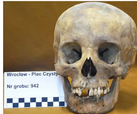
Figure 1 Skull from grave number 942 (Czysty Square in Wrocław) – state of preservation.

The sex and age at death of the individual were estimated