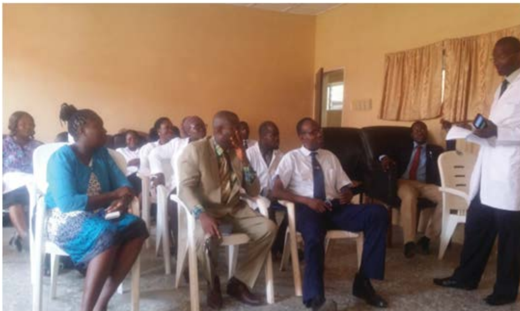
Figure 3 The local class room for training the local medical professionals.

Our host, Dr. Onakpoya took us to visit a local TV station in the town. Then we visited the King palace which was magnificently built including court of law. After that we visited various