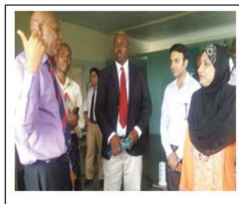
Figure 4 The CEIF team remained involved in teaching and training nurses, to ICU management, perfusion and physical therapy.