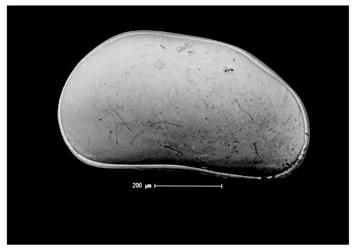
Figure 2. Lateral view of female Pseudocandona albicans Brady, 1864