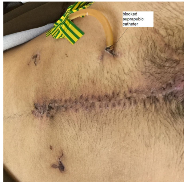
Figure 3: Blocked suprapubic catheter.

Resection of injured rectum was done at pelvic floor with primary rectorectal stapled anastomoses with circular stapler no 29. Intraoperative leak test was done which showed no leak from anastomoses and hence diversion stoma was avoided. Vascularized omentum was placed between rectum and bladder. Abdominal drains placed. Patient was started oral liquids on Postoperative day 1. Patient recovered well without complications and was discharge on Postoperative day 7. He was followed up to 1 year after surgery and was asymptomatic ( Figure 3 ).