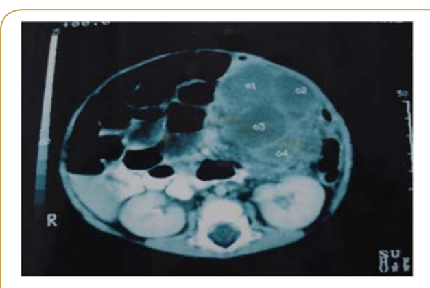
Figure 1 Contrast CT of abdominal cystic lymphangioma showing hypoechoic multi-locular cystic mass with multiple enhanced septa arises in the sigmoid mesocolon.

Complete surgical excision of the cyst (cystectomy) could be done in seven patients (53.8%), excision of the cyst with the adjacent part of intestine that is intimately adherent to it in four patients (30.8%), partial excision of a huge cyst with intraperitoneal marsupialization in one patient (7.7%) and incomplete excision of the cyst leaving a small part of its posterior wall adherent to superior mesenteric vessels done in one patient (Table 1) . After surgery, the excised specimens sent for histopathological examination and proved to be cystic lymphangioma by its characteristic histological criteria of lymphatic spaces lined by flat endothelial cells, lymphoid aggregates and foam cells containing lipoid material in stroma and smooth muscle fibers in