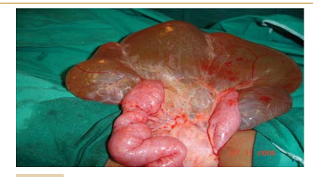
Figure 2 Cystic lymphangioma of ileal mesentery.