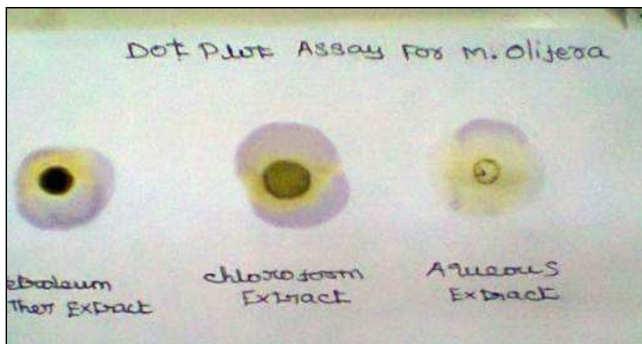
Fig 3: Dot plot assay for Petroleum ether > Chloroform > Aqueous extracts