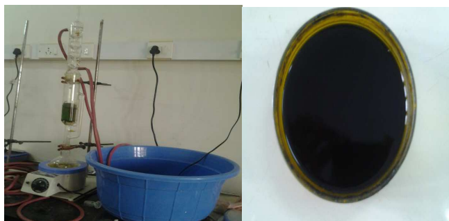
Fig 1: Soxhlet extraction procedure and the concentrated extract