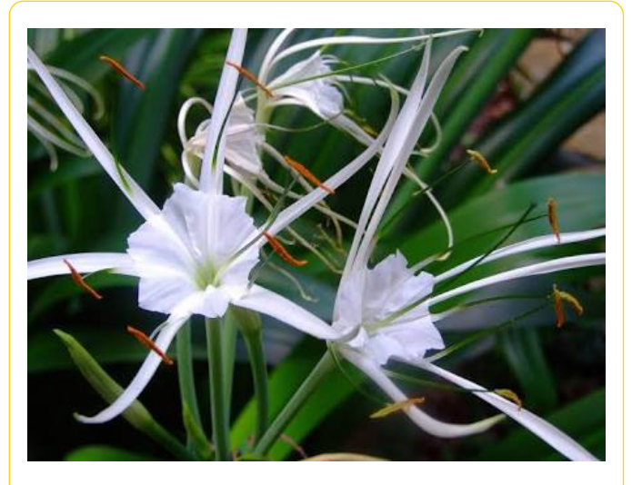
Figure 1 Hymenocallis littoralis (Jacq.) Salisb. Flower.

lycorine [3]. Since 1920, there are several alkaloids that have been discovered from H. littoralis bulbs; such as littoraline, trazettine, o-methyllycorinine, pretazettine, macronine, lycorine.homolycorine, demethylmaritidine, haemanthamine, vittatine, and 5,6-dihydrobicolorine [4], hippeastrine, 11hydroxyvittatine and two flavonoids guercetin3'-O-glucoside and rutin were isolated. In addition, Abou-Donia and coworkers 2008 identified 26 known volatile constituents from H. littoralis flowers. The primarily isolated lycorine alkaloid from H. littoralis was proven to have antineoplastic, cytotoxicity and antiviral properties [5]. Pancratistatin from H. littoralis has been proven to be effective against 60 human cancer cell lines including melanoma, brain, colon, lung and renal cancers by U.S. National Cancer Institute's panel [6,7]. In healthcare practices the traditional uses of medicinal plants are providing clues to new areas of research and hence its importance is now well recognized [8,9]. In this study the antiinflammatory activity was attempted to prove the efficacy of flower of H. littoralis .