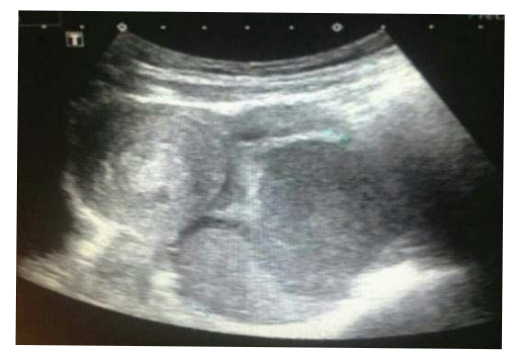
Transvaginal ultrasound showing a solid hypo Figure 1 echoic area just left to the uterus, with a differential diagnosis of solid left adnexal mass.

Two separate uteri were identified. The left uterus was of 8 x 6 x 6 cm in size and linked to left accessory organ with abnormal development. No fimbrae was noted in the left side which was linked to the left ovary with a large cyst of about 9 cm in size at the end of the fallopian tube. The anterior wall of the left uterus was adherent with the pelvic wall forming a concealed area filled