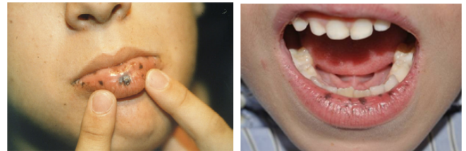
Figure 1 Melanosis on Lips.

to be caused by inflammation and blockage of melanin migration from cells where it is produced (melanocytes) to cells forming the outermost layer of the skin (keratinocytes) [5].