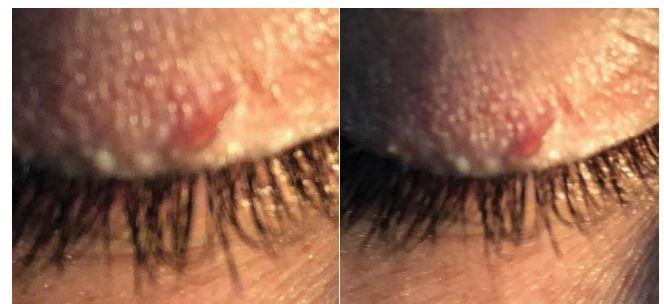
Figure 1 and 2 Cilium Incarnatum Externum on Slit Lamp.

Citation: Ayachit S, Helaiwa KA, et al. (2022) Cilium Incarnatum Externum and Its Management – A Rare Presentation. Health Sci J. Vol. 16 No. 2: 914.