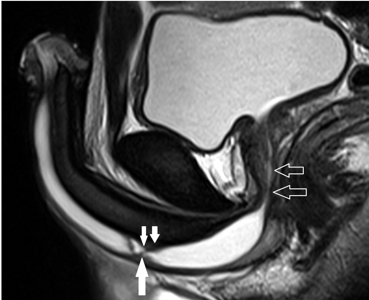
Figure 1 T2 weighted, sagittal, MR image in a patient shows anterior urethral stricture (large white solid arrow) and spongiofibrosis (small white solid arrows) with normal-appearing posterior urethra (hollow arrows).

An experienced radiologist blinded to both RGU and MRU findings, recorded the SUG findings. While the radiologist recorded MRU findings, he was blinded about the RGU and SUG findings of the patient.