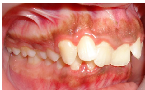
Figure 3 Right side.