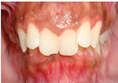
Figure 1 Frontal view.

Citation: Abuaffan AH. Anterior Open Bite with Midline Diastema. Ann Clin Lab Res. 2016, 4:2.