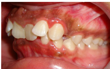
Figure 2 Left side.