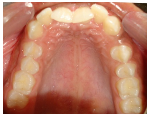
Figure 4 Upper jaw.