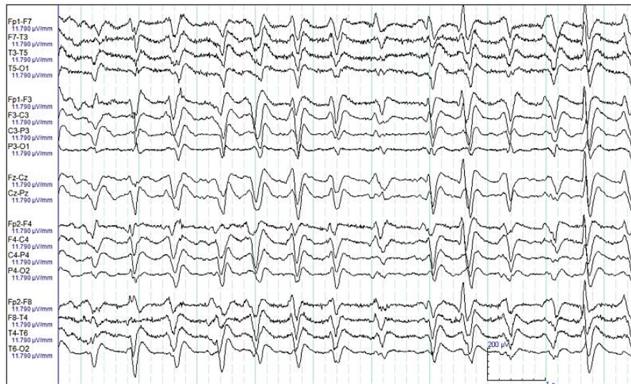
Figure 4 82-year-old woman with Cephalosporin-Related Neurotoxicity, 4 days after starting Cefepime. The EEG shows a slow background with triphasic waves occurring at 1.5 Hz with an anterior to posterior phase lag, characteristic of Cefepime-induced encephalopathy.

who develop neurotoxic side effects from those who do not.