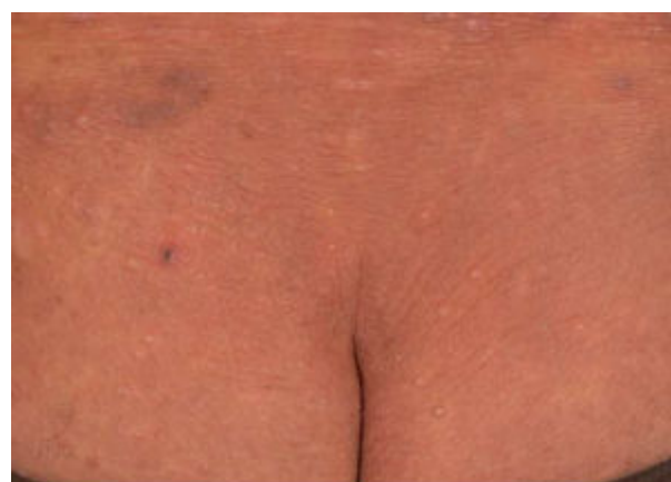
Figure 1 Multiple dome-shaped papulo-nodular lesions ranging from 0.5 cm to 1 cm on the posterior upper trunk and buttocks, with a background of xerosis and inflammation consistent with Atopic Dermatitis.

The patient had childhood asthma and poorly-controlled longstanding AD for over 40 years which mainly affected his limbs and trunk. This included recurrent extensive excoriated papules and plaques with lichenification over the flexural areas in affected sites. He was treated with topical steroids (0.0125% betamethasone valerate and 0.1% betamethasone propionate twice daily for the face and trunk respectively) and emollients, having repeatedly refused systemic immunomodulators and phototherapy. He also had ischaemic heart disease, for which he was taking Clopidogrel 75 mg daily.