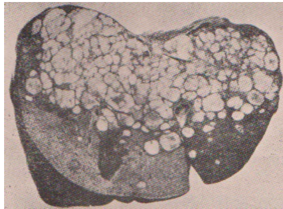
Figure 4 Vertical section of the liver showing the abundance of cancer nodules in its upper portion in a case of lung cancer; it is unlike expectations from haphazard scatter by way of the arterial system.

LMSF naturally directs positional activities during metastases. Consequently, what remains to be done is clear. It is, indeed, to hypothesize that this Factor is what is responsible for the well-directed natural phenomena which are traceable in lymphatic metastasis. In all probability, target therapy will result from recondite researches carried out on it, especially in the recently sprouting Translational Institutions [23].