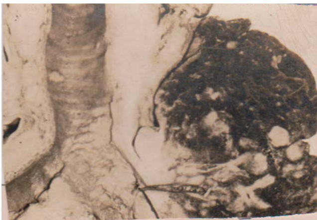
Figure 1 Section of left lung tumor shows sheathing of the trachea with deposits partially coalescent in the ipsilateral bronchus and isolated in the proximal right bronchus.

In this context, the clear colonization patterns repeatedly pointed to the need to trace the footsteps of lymph-borne cancer cells all the way from the lung to, say, the abdominal lymph nodes [10]. In particular, I noted that the earliest deposit was present beneath the node's convex border, i.e, where lymph flows in, ( Figure 2 ). Accordingly, I theorized six times that new lymphatic vessels were being formed. Nowadays, this is being called