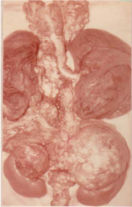
Figure 3 Mono-block formalin-fixed specimen showing the lungs; the primary right tumor is next to the coalesced mediastinal lymph node deposits. The selective association is apparent from the cross over not only to the left neck nodes but also to the left adrenal gland.