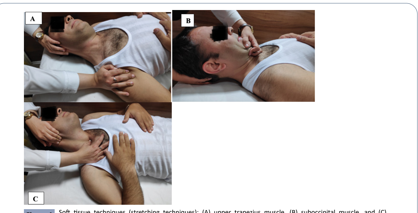
Figure 4 Soft tissue techniques (stretching techniques): (A) upper trapezius muscle, (B) suboccipital muscle, and (C) Sternocleidomastoid muscle.

All of the variables had normal distribution. Sixty-five participants were screened, but only 40 participants were enrolled in the study, with 20 participants allocated to the DN group, and 20 to the STT group. The mean of subjects' age in the DN group was 36.10 \pm 10.43 and in the STT was 40.40 \pm 11.27 . There was no